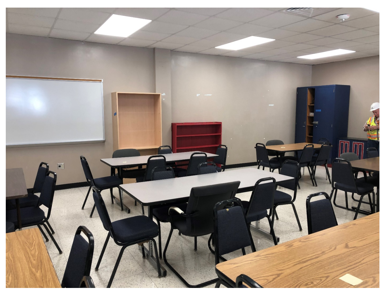
Classrooms are complete and ready for instruction.