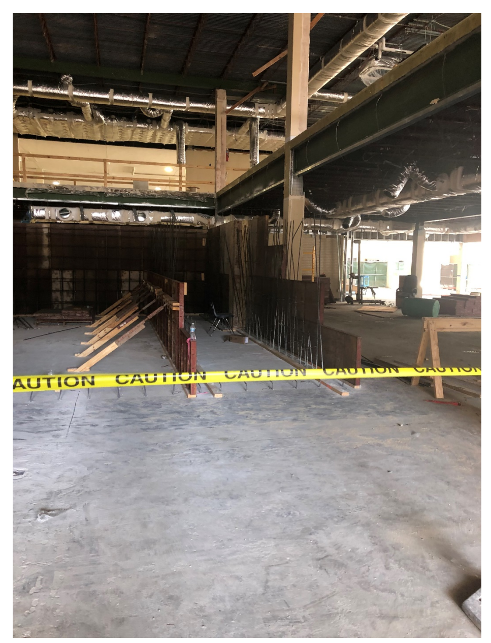
Library stairs under construction. - Interior