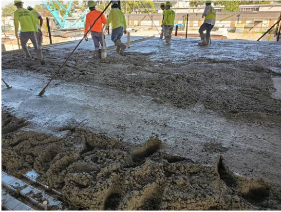
Elevated concrete pouring