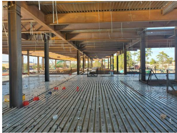
Elevated deck prep for pour