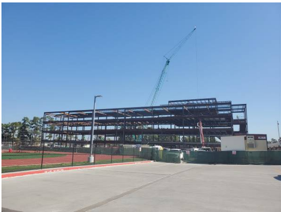
Overall from the west