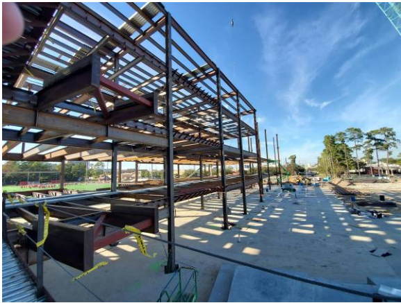
Overall steel looking north to area A