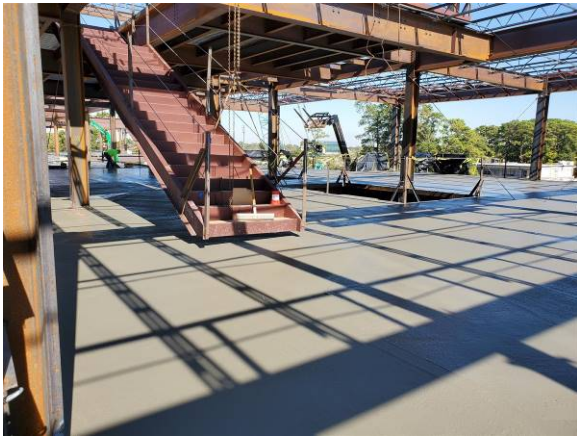
Elevated concrete pouring