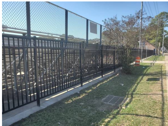
New ornamental fencing along Gaylord Dr