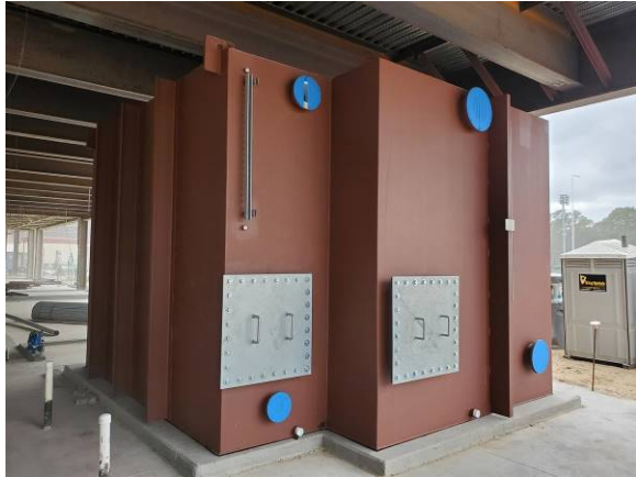
Water tank installation