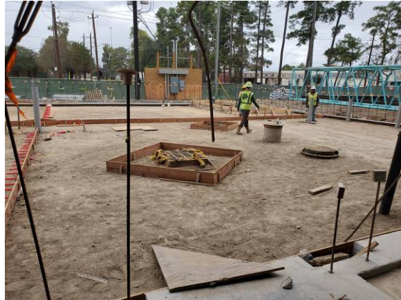
Prepping for service yard concrete