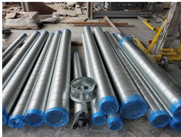
Ductwork on site