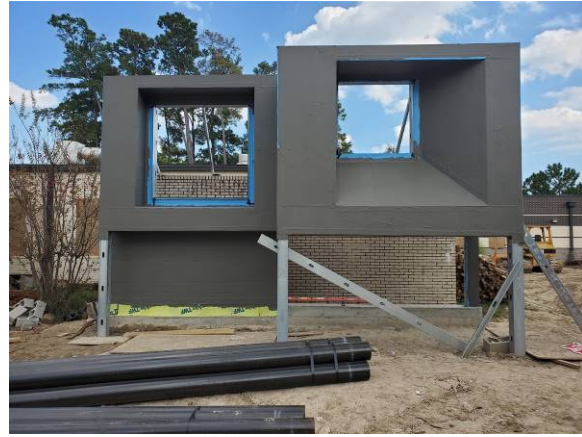
Mockup wall progress (air barrier)