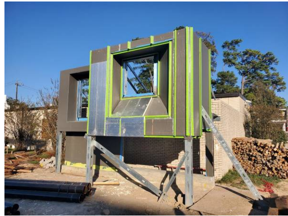
Mockup wall progress (insulation and stone clips)