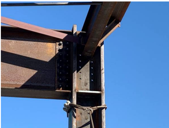
Steel plate connections from columns to beams