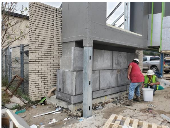
Mockup wall stone being installed