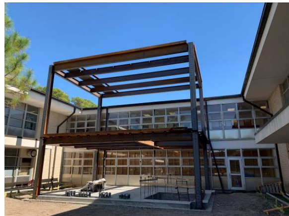
Area L new elevator framing (near existing library)