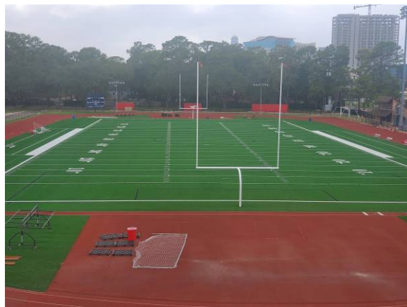
Overall new turf field from the new building