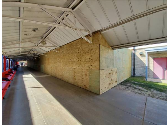
Wall protection from existing covered walkway