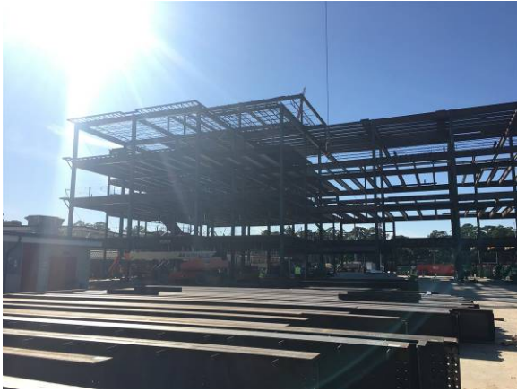
Overall Steel area B