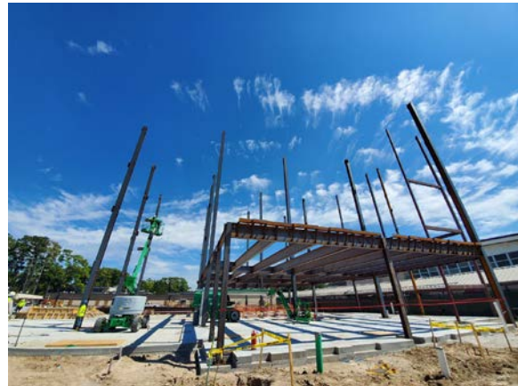
Steel erection Area B