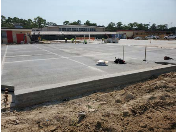
Slab pours complete