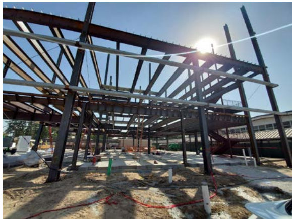
Steel erection and detailing