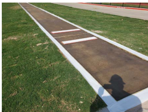
Primer on long jump runways