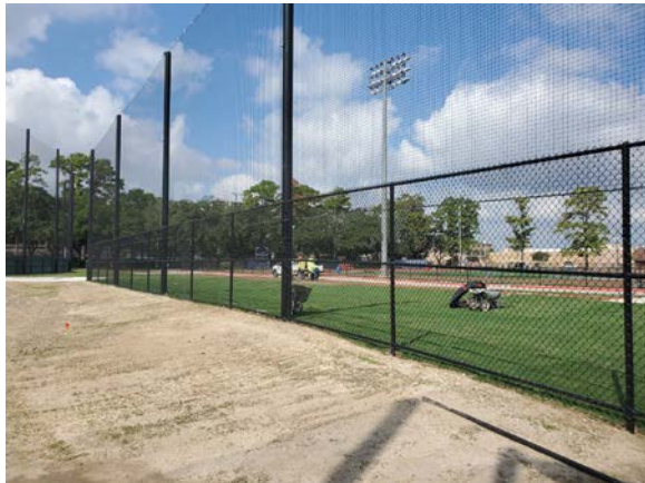
Field events areas (Discus)