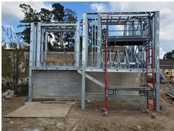
Framing for mock-up wall