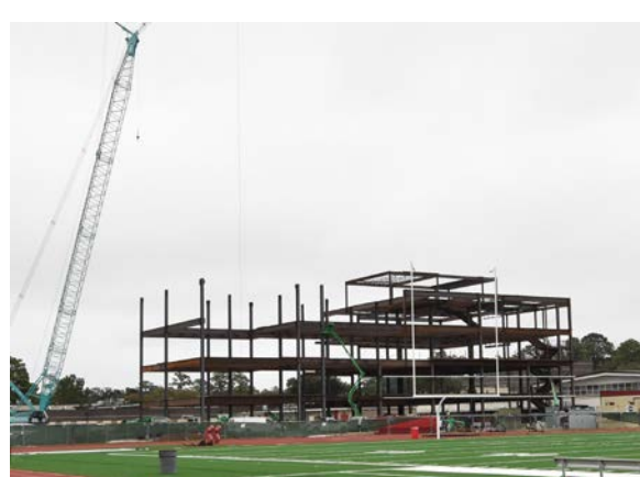
Overall steel Area B and partial Area A