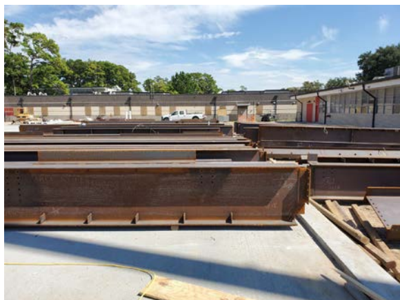
Steel staging in Area C