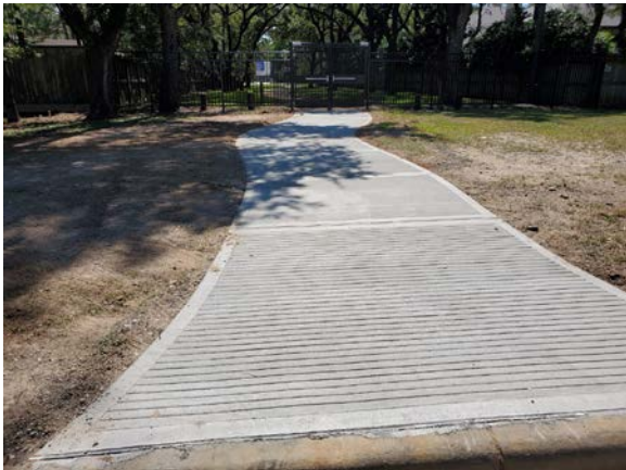
New sidewalk to existing neighborhood park