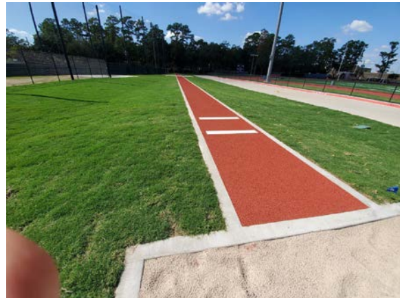
Completed long jump / pole vault runways