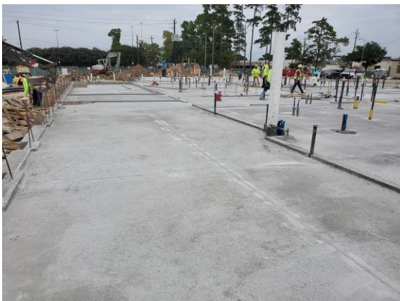
Overall slab Area A