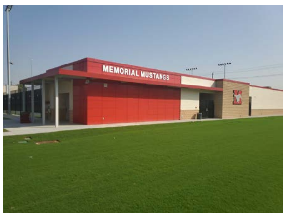
Tennis building complete