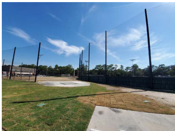
Field events netting