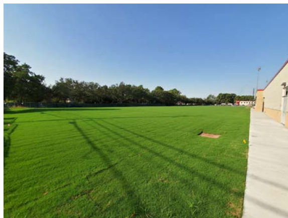
East campus grass growing in