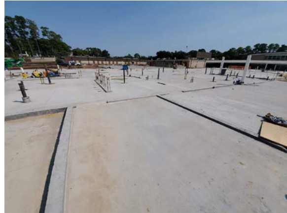
Saw cutting slabs