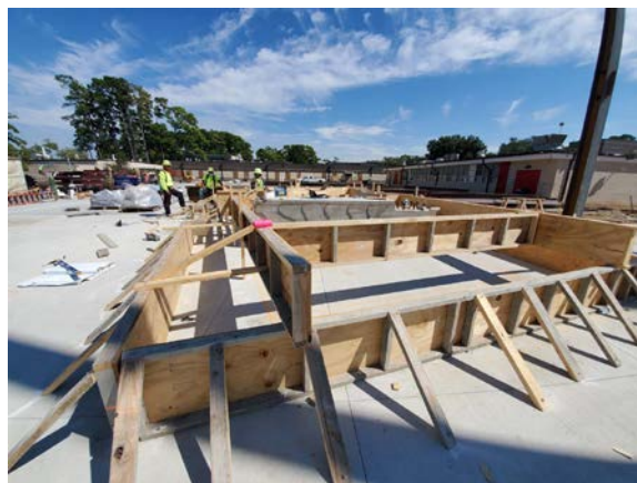
Forming atrium stair platform