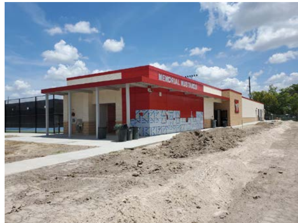
Tennis building with prep for grass fields