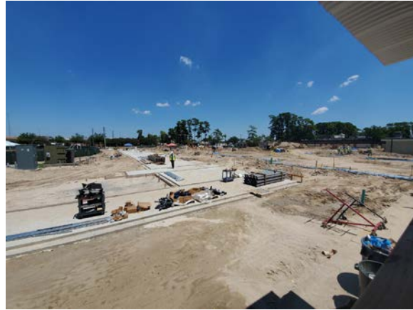
overall new building area