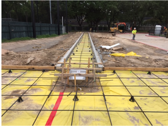
Prep for long jump / pole vault pads