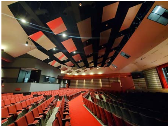
Renovations; new auditorium lighting