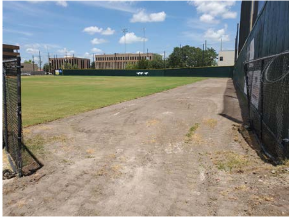
Grass replacement at baseball