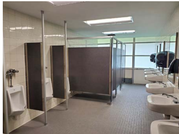
Renovations; new toilet rooms