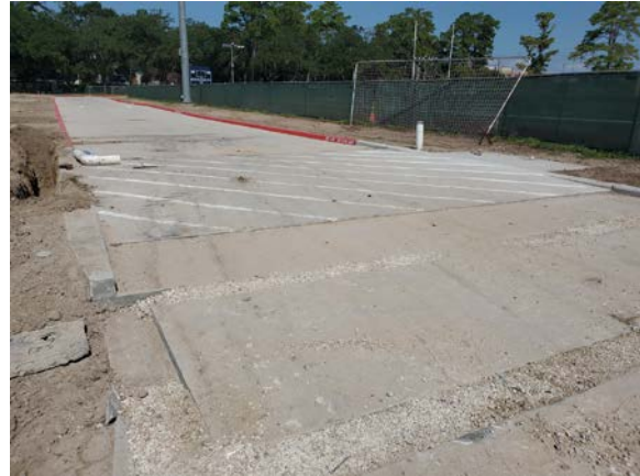
new west driveway