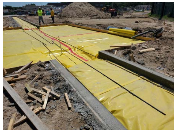
Prep for long jump / pole vault pads