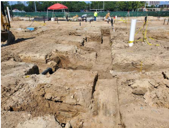
Foundation prep (underground utilities)