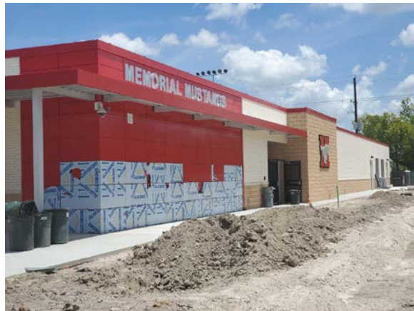
Completed Tennis Building