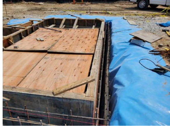
Foundations at elevator