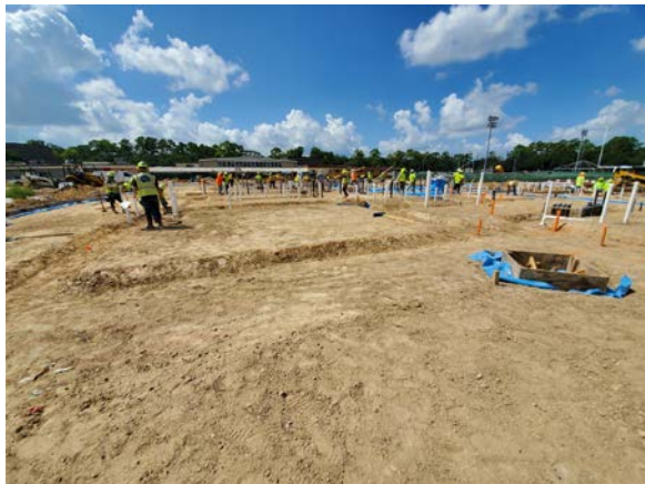
New building pad prep for concrete