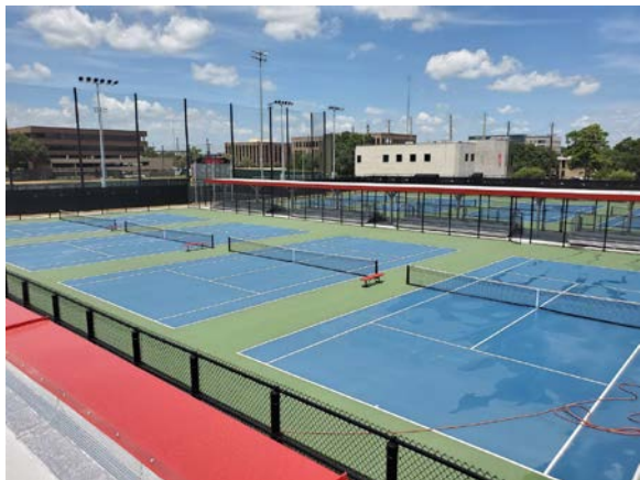
Completed Tennis Courts