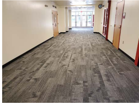
Renovations; new carpet