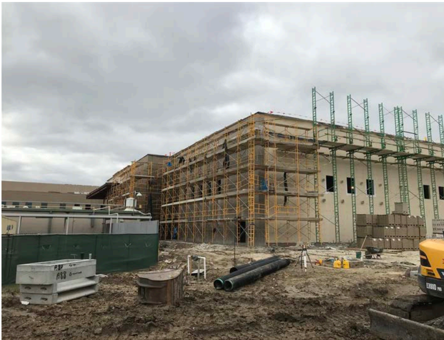
West façade at classroom wing