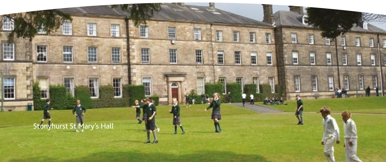
Stonyhurst St Mary's Hall