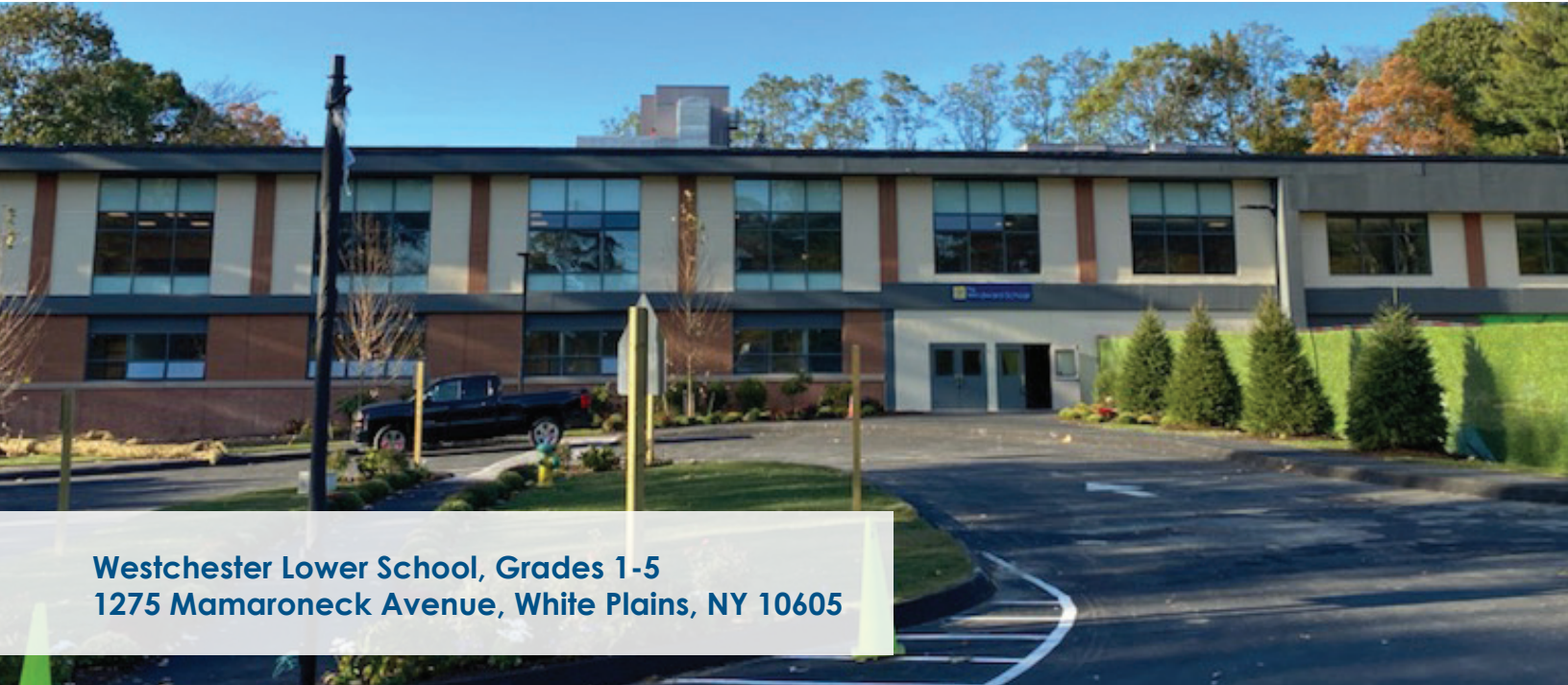
Westchester Lower School, Grades 1-5 1275 Mamaroneck Avenue, White Plains, NY 10605