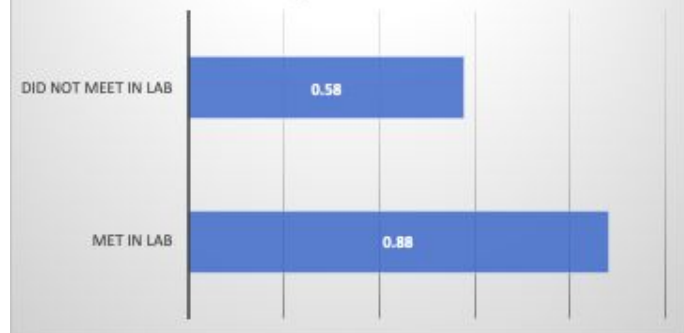
March Average Credit Attainment

Researchers who came to the lab for support earned more credit than those who earned credit without lab support. Let us help you!