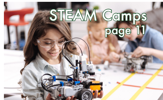
STEAM Camps page 11