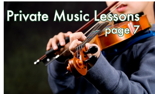
Private Music Lessons page 7