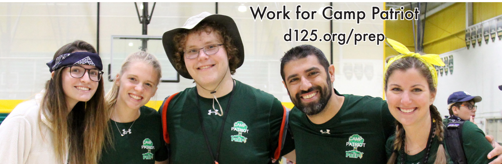
Work for Camp Patriot d125.org/prep