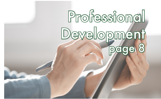
Professional Development page 8

Please note that we'll be requiring screening & temperatures upon entry.