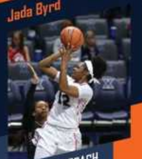
CAMP GIRL'S COACH

Kyiv International School Student Athletes are invited to attend the first session of camp at the heavily discounted price of $100 (a savings up over $400).