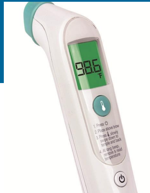
Touchless Forehead Thermometers