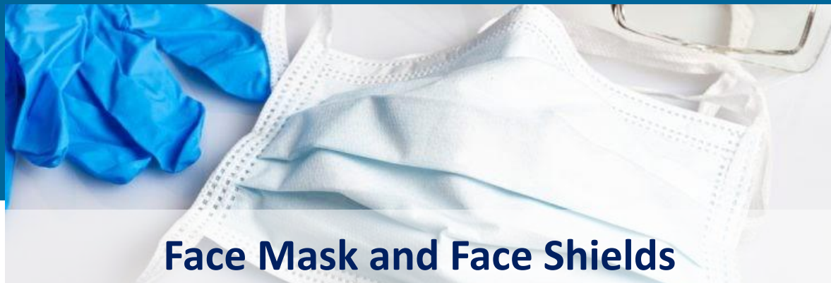
Face Mask and Face Shields