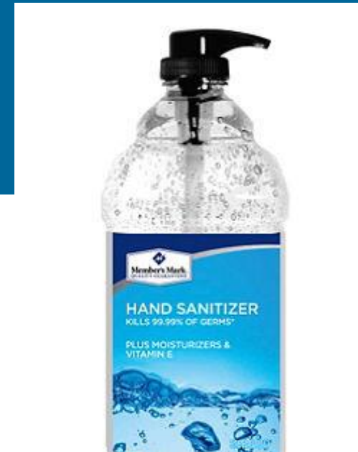
Hand Sanitizer and Dispensers

Since March 13, 2020 through January 31, 2021, TCUSD has purchased $303,258 of PPE and $118,819 of custodial supplies for the pandemic.