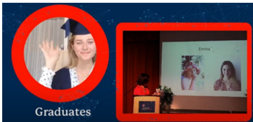
Grade 12 Virtual Graduation Ceremony