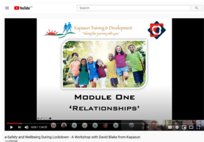
E-Safety Workshop, hosted on Microsoft Teams and shared on Youtube

Another key takeaway from the thorough preparation for virtual learning, was the heading-off-at-the-pass of a potential barrage of safeguarding and child protection concerns as a result of all school work being linked to and conducted from children's homes. Our expert pastoral and safeguarding leads researched and sort guidance from the wider international school network to better understand concerns they'd faced and addressed already, including schools in Hong Kong and Malaysia. ISL staff, parents and students were briefed on new protocols and practices to keep our community safe, which is always our highest priority, in physical or virtual school..