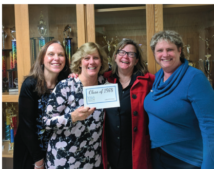
Alumnae Reunion November 24, 2018