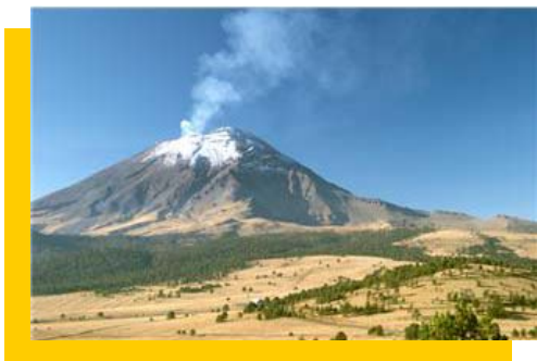
Plate tectonics is a unifying geologic theory that explains the formation of major features of Earth's surface and important geologic events. Sixth-grade students learn about the evidence of past plate tectonic movement and about landforms and topographic features—such as volcanoes, mountains, valleys, and mid-ocean ridges—generated by plate movement. They discover that major geologic events, such as earthquakes, volcanic eruptions, and mountain building, result from plate movement and often occur at the boundaries of the plates.

Students also learn that Earth is composed of three distinct layers: the lithosphere, the mantle, and the core. They understand that the flow of heat and material within Earth drive the movement of lithospheric plates, and they apply an understanding of plate tectonics to explain the major features of California geology.