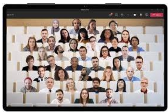
1 - 365 TEAMS new group video view.