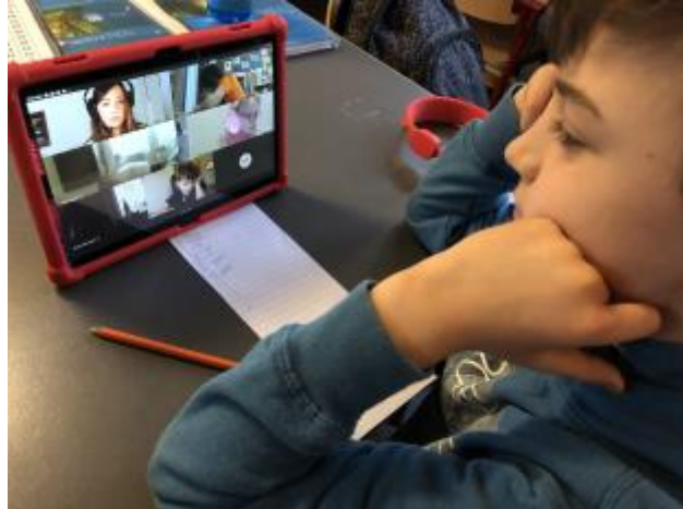
2 - 7-9 YO Digital Lesson on Teams