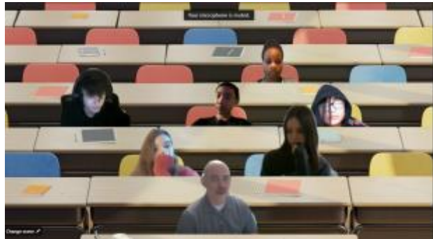
1 - 12/13YO Virtual Classroom