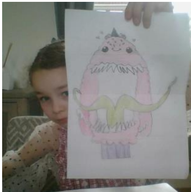
2 - Open up the picture and it changes!