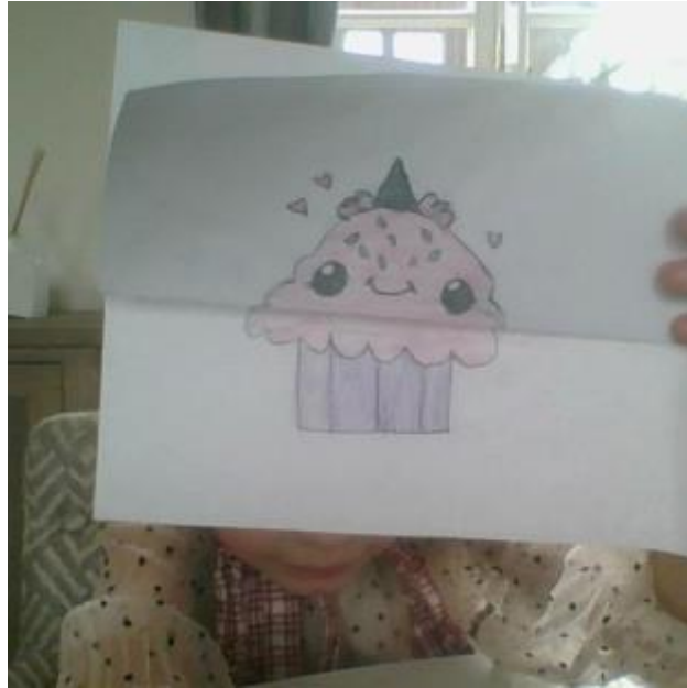
1 - Student draws a picture with a fold in the middle...