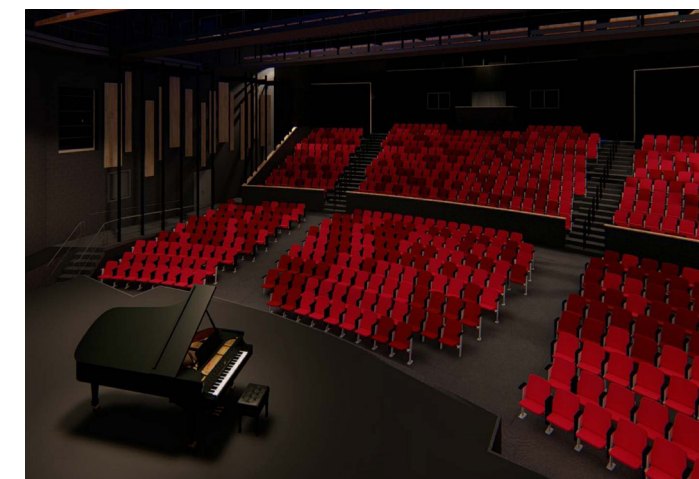
Concept drawings by DeVetter Design Group

On April 13, the School Board unanimously approved a package of bids for additions and renovations at Central Middle School. Construction started April 29. As part of the bond referendum approved by voters last year, 6 th grade students will move to CMS in fall 2021. To support this plan, the district will construct a classroom wing, an additional gymnasium, expand the lunchroom and add a theater.