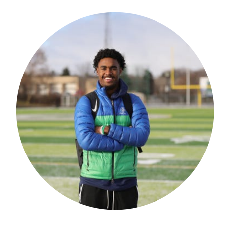
IN-PERSON LAKER EXCELERATION