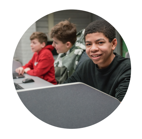
IN-PERSON LAKERS TAKE ACTION!