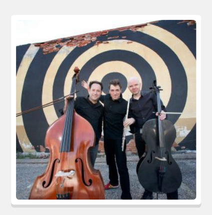
Project TRIO music