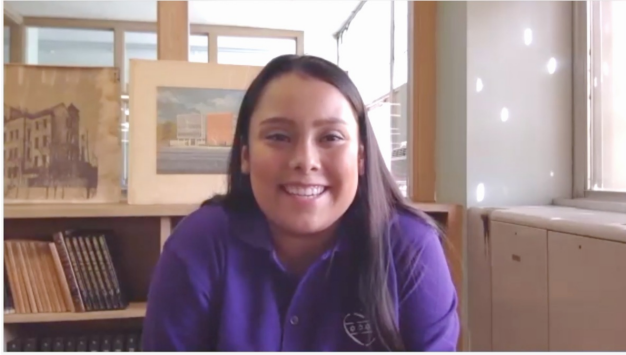
Josephinum Academy 2020-2021 Admissions

when masks and social distancing weren't needed!