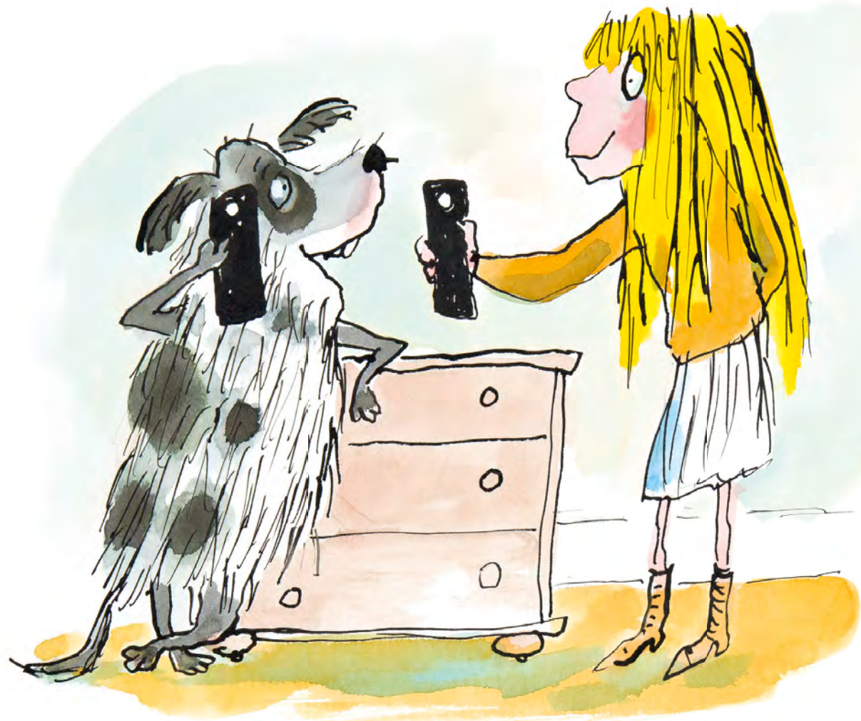
She shared a talking dog called Rover,