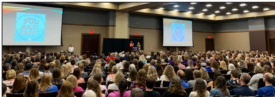
District staff gather together for the all-district meeting on Sept. 3rd

For all of our students, we are increasing our investment in counselors and other support personnel. The Ferndale School District doubled down on its investment in counselors over the past two years and will continue this investment in the 2019-2020 school year with eleven counselors serving our ten schools.