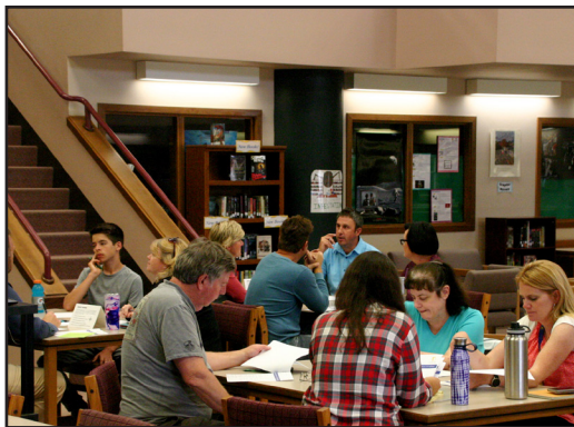
The Design Advisory Committee meeting in the FHS library

The desire for community participation prompted the Ferndale School District to advertise for Design Advisory Committee (DAC) members. The Design Advisory Committee is (1) researching best practices for high school facilities; (2) soliciting community input; (3) sharing their own expertise; and (4) reviewing and providing feedback on design ideas.