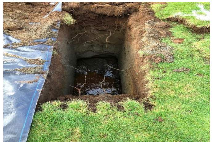
Ground water was generally encountered at around four feet.