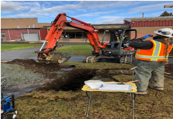
A series of additional soil test pits were excavated on Monday, February 17, at the new high school location.