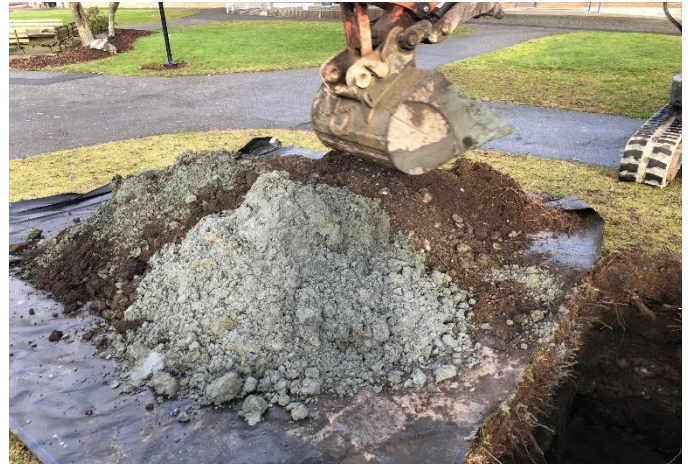
A close up of the various soil types encountered.