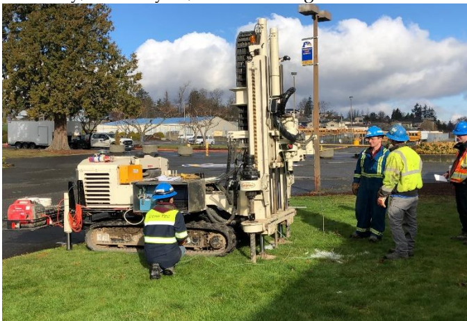
Cone Penetrating Testing (CPT) extended down 40 feet below ground to determine the level of dense soils.