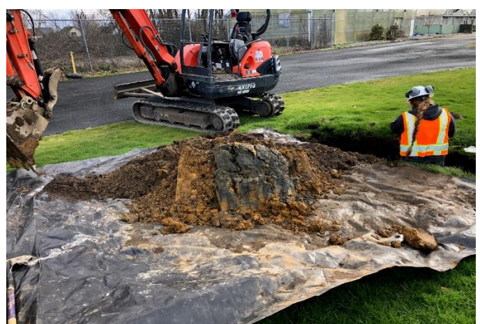
Another test pit location on the east side of the football field.