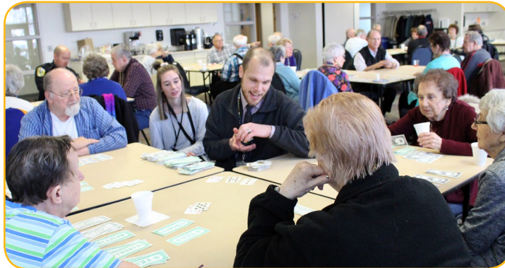
More photos from past celebrations are featured on the back cover!