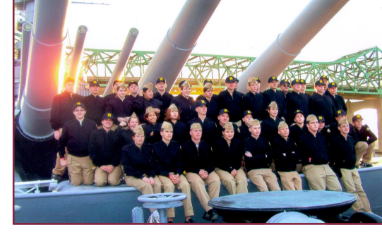
Cadets on a battleship