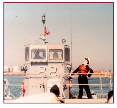
Cadets on a small craft at sea

These are all voluntary and incur a cost equivalent to the cost of any summer camp for youths.