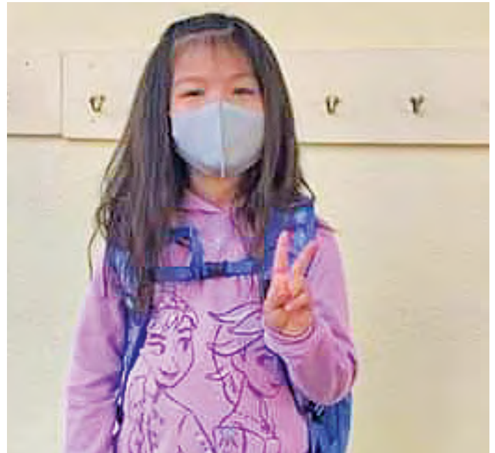
Escondido Kinder student excited for her first day back at school!

I'd like to share with you some of my priorities for our school. My primary goal is to ensure that all children are safe, happy, ready, and engaged to learn and have the best possible educational experiences while at Escondido Elementary. I follow a collaborative and team-building approach and believe that differentiated, rigorous, and developmentally appropriate and relevant instruction is key to achieving this goal. I base every decision I make on what is best for students. In the spirit of building a strong school team, I look forward to working with staff, parents, and students throughout the year to identify areas for improvement in student social-emotional well-being and academic achievement, school climate, and communication.