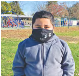
A fabulous Duveneck Dragon 1st grade Student!

They have demonstrated the ability to accept help, to persevere, and to trust the adults who are supporting them. They are learning that putting in the effort, even baby steps at first, will positively change how they see and feel about themselves as learners.