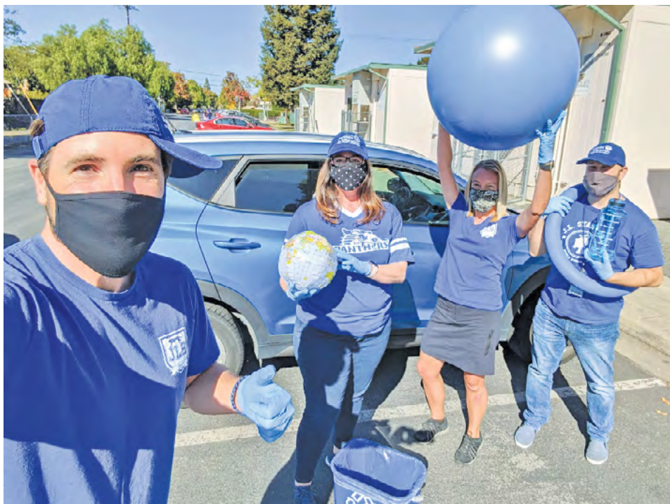
The JLS Admin Team posed for a "Blue Monday" challenge.

Despite the challenges of being apart, these small, lighthearted moments add up to larger feelings of joy and