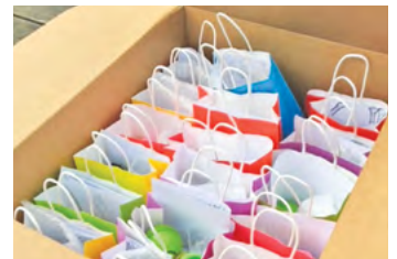
Soothe Bags Ready for Distribution

them out during our final's week. To find out more about the ROCK program, please visit our website at https://gunn.paloaltopta.org/sources-of-strengthrock/ .