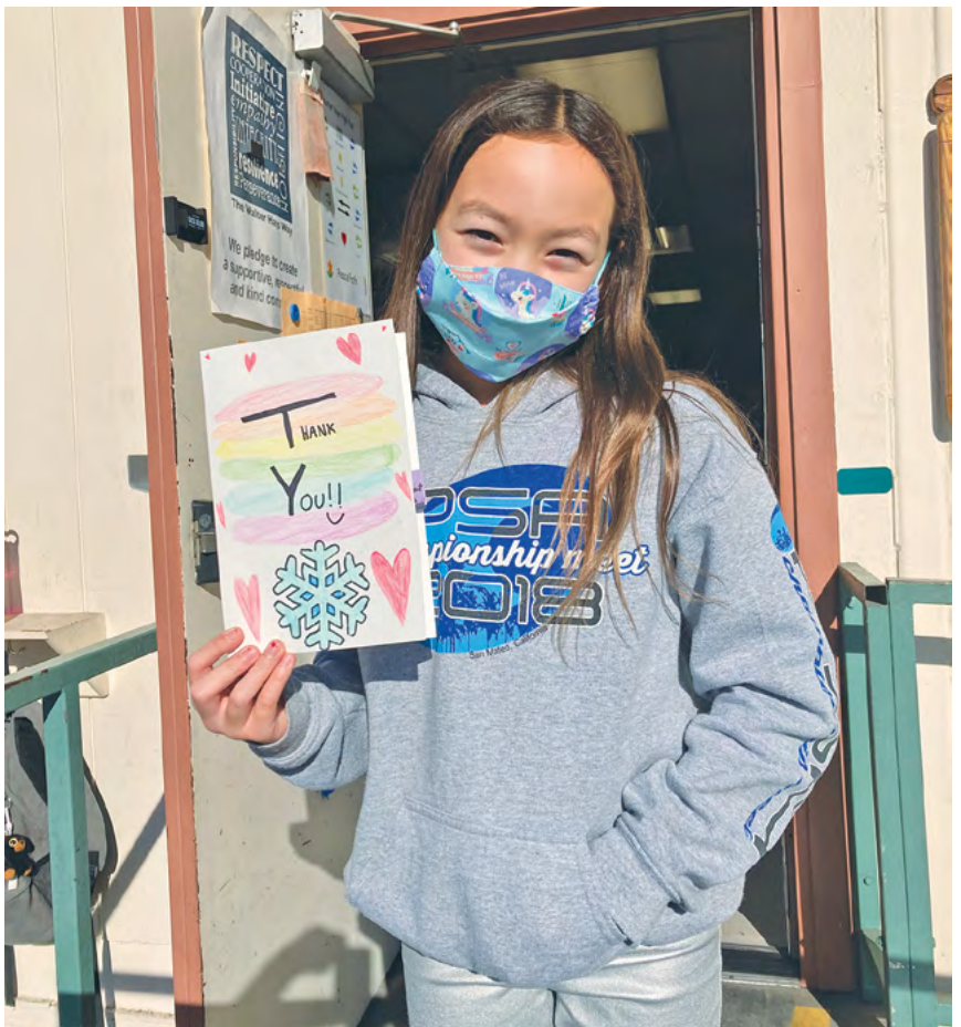
Student Showing a Thank You Sign

The Stanford ICU called to thank our students for their letters, as their touching messages meant the world to them, our Ambassadors of Hope!