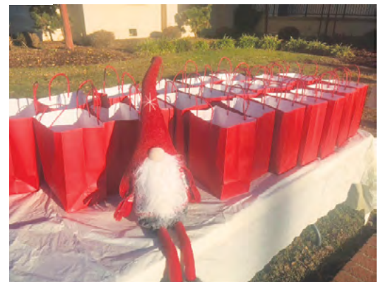
End of Semester breakfast distribution (partnership with PTSA)