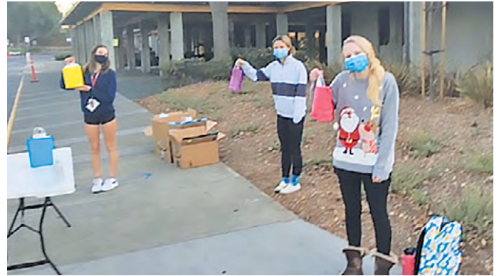
Distributing Soothe Bags

ROCK is a student-run, peer-helping group whose mission is to build connection and wellness at Gunn and in the greater community. In order to serve more students, our PTSA created more bags and continued to hand