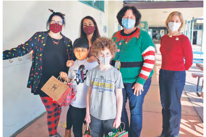
Last Day of Hybrid before the break.