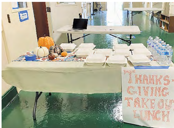
Staff Thanksgiving gift and dinner distribution