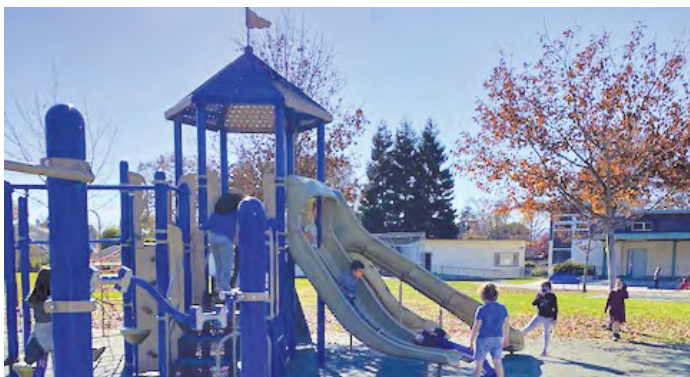
A beautiful day to play on the playground during recess!