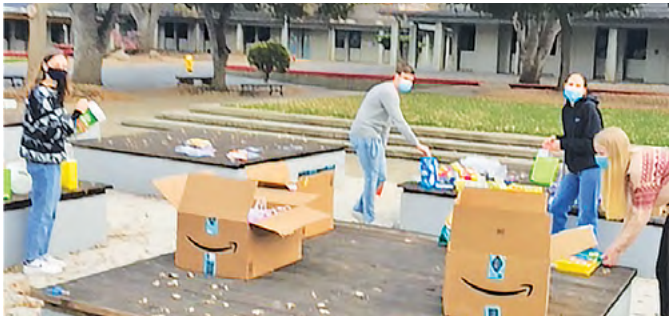
Students Putting Together Soothe Bags

and bubble wrap. During and after school hours, students of all ages drove by the front of our school and received their bags. The enthusiasm of the students as they handed out the bags was probably more soothing and energizing for the students in the cars than the bags themselves.