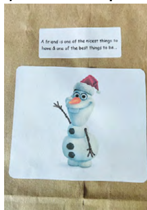
Weekly gift bag example