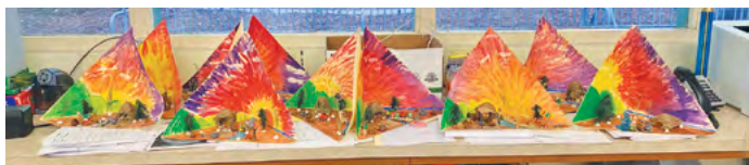
3rd Grade Ohlone Project

They have demonstrated the ability to accept help, to persevere, and to trust the adults who are supporting them. They are learning that putting in the effort, even baby steps at first, will positively change how they see and feel about themselves as learners.