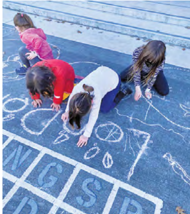
Being creative with chalk at recess!

For students at Duveneck Elementary School, hope has involved a lot of change this year, and change requires willingness and a commitment to take the necessary actions to move in the direction you want to go. I have had the privilege of witnessing wondrous changes in our students' lives.