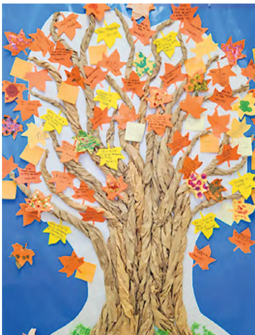
Being Kind and Friendly – Our Friendship Tree

It wasn't long before we started to welcome students back to our classrooms, and what a difference it made! The children were thrilled to be back at school, and their teachers were struck by just how excited they were to learn. All of the worries about how PPE and social distancing might impact learning disappeared as the children eagerly awaited their teachers