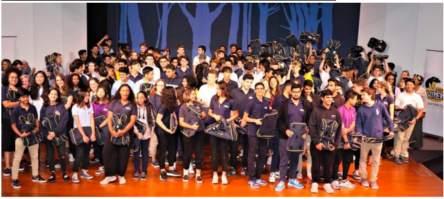
(pre covid-19 pictures)