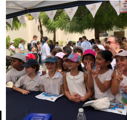
(pre covid-19 pictures)