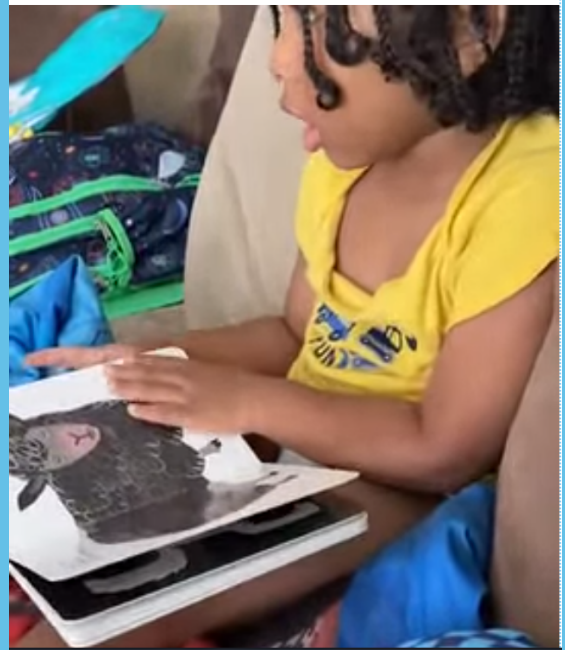
TEAM FIRST BOOK

Beginning February 1, families with children 3 or 4 years old on August 31, 2021 are encouraged to apply for the New Hanover County Schools Early Education Program. Applications can be submitted online.