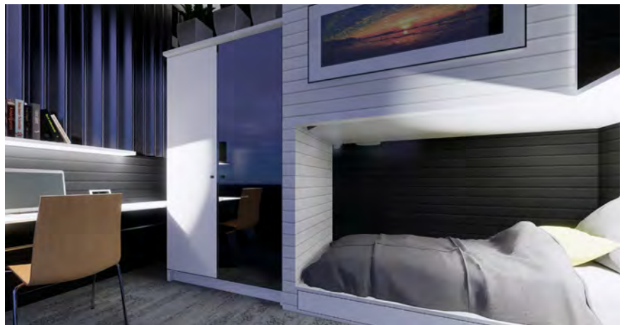
Griffith House ▼ Harlin House room (artist's impression) ▲

The senior boarding house provides accommodation for 81 boys in Years 9 to 12. Harlin House renovations will start in 2021, providing a modern individual room for each boy, and new spaces for study and social activities.