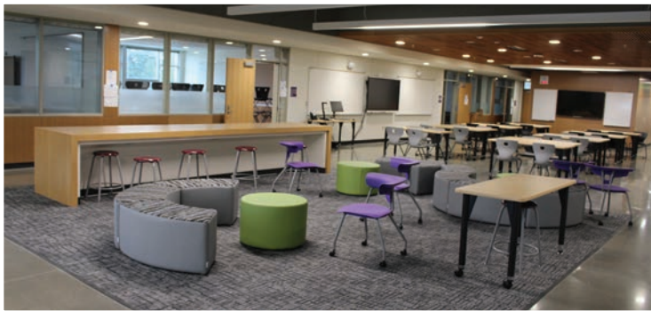
A shared space in the LWHS addition provides flexibility for small-group breakout sessions while still allowing for visibility from neighboring classrooms.

The original LWHS building construction was funded to accommodate capacity for three grade levels (10-12). The planning and design included future additions (both classroom and core space) that could be added as enrollment increased. Voters approved funding for the 20-classroom addition, as well as expansion of the commons and auxiliary gym as part of the 2019 Capital Projects Levy.