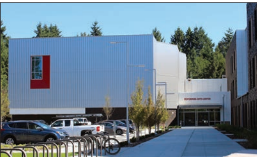
Community theatergoers will enjoy a contemporary Performing Arts Center, which seats 424 people.

The rebuilt and enlarged school has a capacity of 1,800 students. The three-story, circular design encourages connection and community in spaces such as the commons and library. The teaching spaces include general classrooms as well as classrooms for science, art, Career and Technical Education (CTE), music and special education.