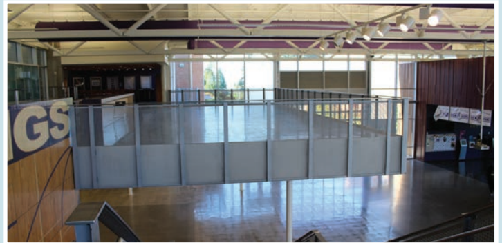
An expanded commons space is now complete, with an expansion on the second floor. This will provide more space for students to sit during lunch when in-person school returns.

The project also included a new secured connection from the main building to the gym, which means the campus is now enclosed. “If there’s a lockdown, you can secure the campus,” said Principal Christina Thomas. “Before we weren’t able to do that.”