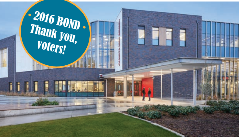
The welcoming entry to Juanita High School. By utilizing GC/CM contracting, the district was able to work with a contractor and our Design and Construction Advisory Committee early in the design process to create a plan that allowed construction to be completed one year early.

When voters approved a bond in 2016, the district expected Juanita High School would be complete in fall 2021. Thanks to a phased construction approach, Phase I opened in fall 2019 and the full school opened in fall 2020. Completing construction one year ahead of schedule saved in labor costs and price escalation.