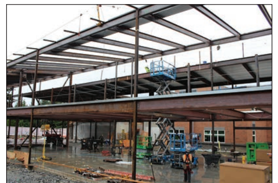
Steel is complete at three elementary school additions.

A four-classroom addition at Rachel Carson Elementary is in the design phase and is scheduled to open in fall 2022.