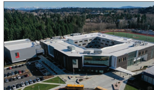
Phase 2 of Juanita High School includes general classrooms as well as art and CTE classrooms.

“It is with gratitude that we recognize the unflinching commitment of our community to our students and staff. With your continued support, Lake Washington School District will continue Building on Success.”