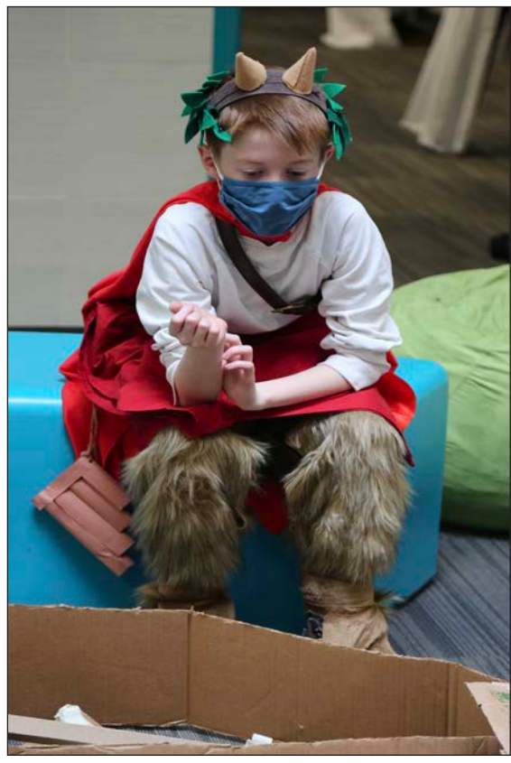
Students wore costumes of all sorts to recognize their study of ancient Greece.