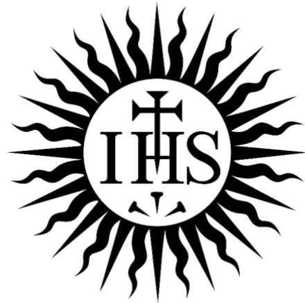
Seal of the Society of Jesus

The Georgetown Prep student at graduation has acquired considerable knowledge of the many needs of local, national, and global communities and is preparing for the day when he will take a place in these communities as a competent, concerned and responsible member. The graduate has been inspired to develop the awareness and skills necessary to live in a global society as a man for and with others. Although this commitment to doing justice will come to fruition in mature adulthood, some predispositions will have begun to manifest themselves.