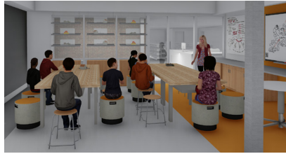
MS STEAM CENTER AND LIBRARY