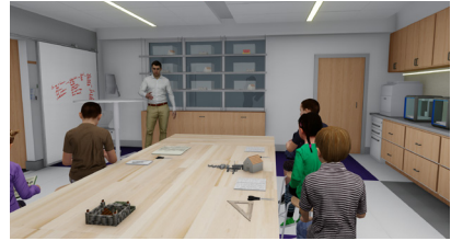
LS STEAM FACILITIES AND CLASSROOMS