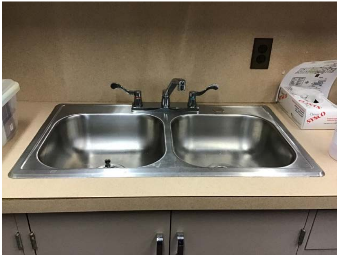
JoBrighton-05: Conference Room, Two Compartment Sink, Faucet