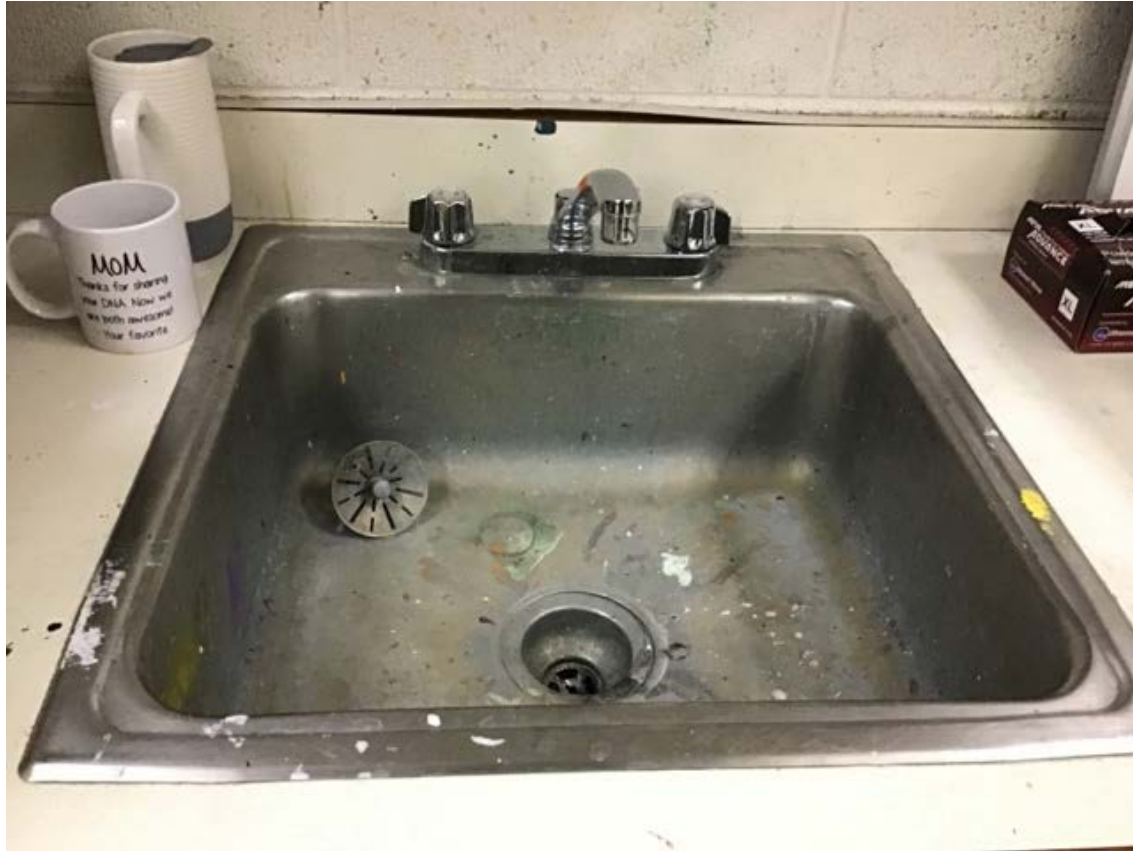
Roosevelt-04: Room C-119, Kitchen Faucet