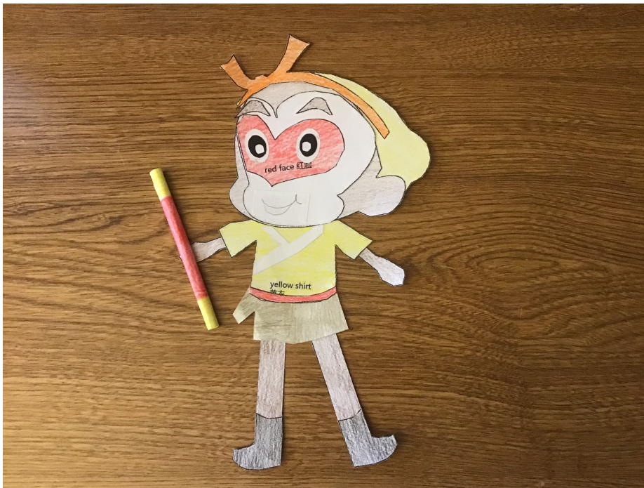
Chinese 1 Monkey King Figure