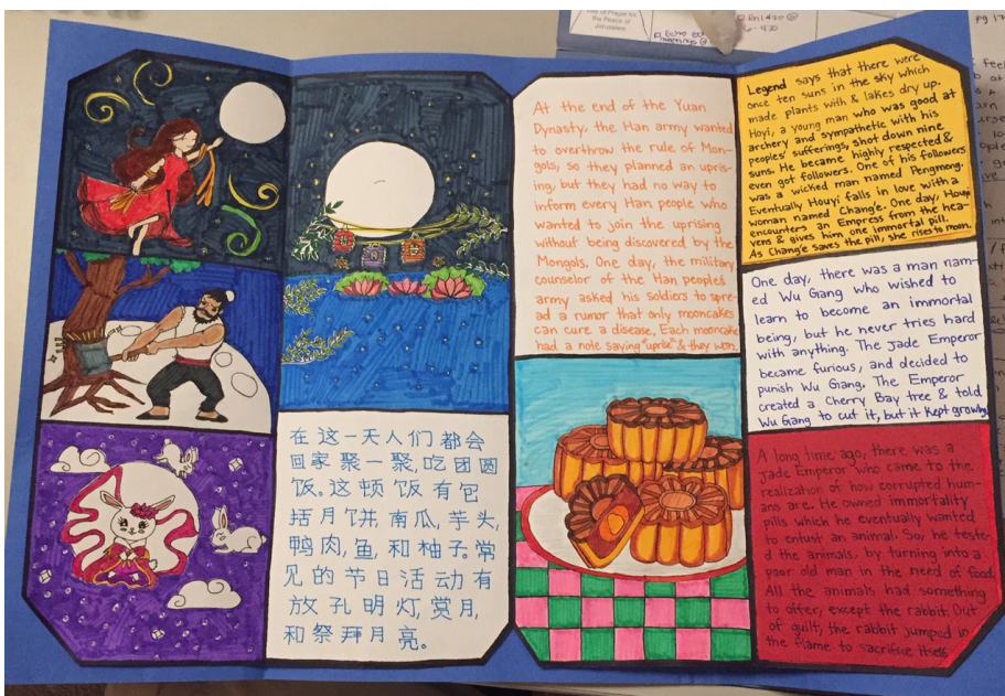
Chinese 2 Moon Festival Lapbook