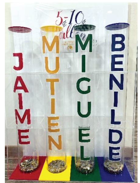
5-10 Cent Challenge

Our dedicated teachers use a child-centred, active learning approach, and strive to support the maximal development of each student. Teachers communicate with students on an individual level while celebrating each student's unique learning style, encouraging them to think and to act rather than to simply respond to the situations they encounter. The learning environment requires intellectual creativity and active class participation, providing students with opportunities for self-discovery, inspiration, exploration, and experimentation.