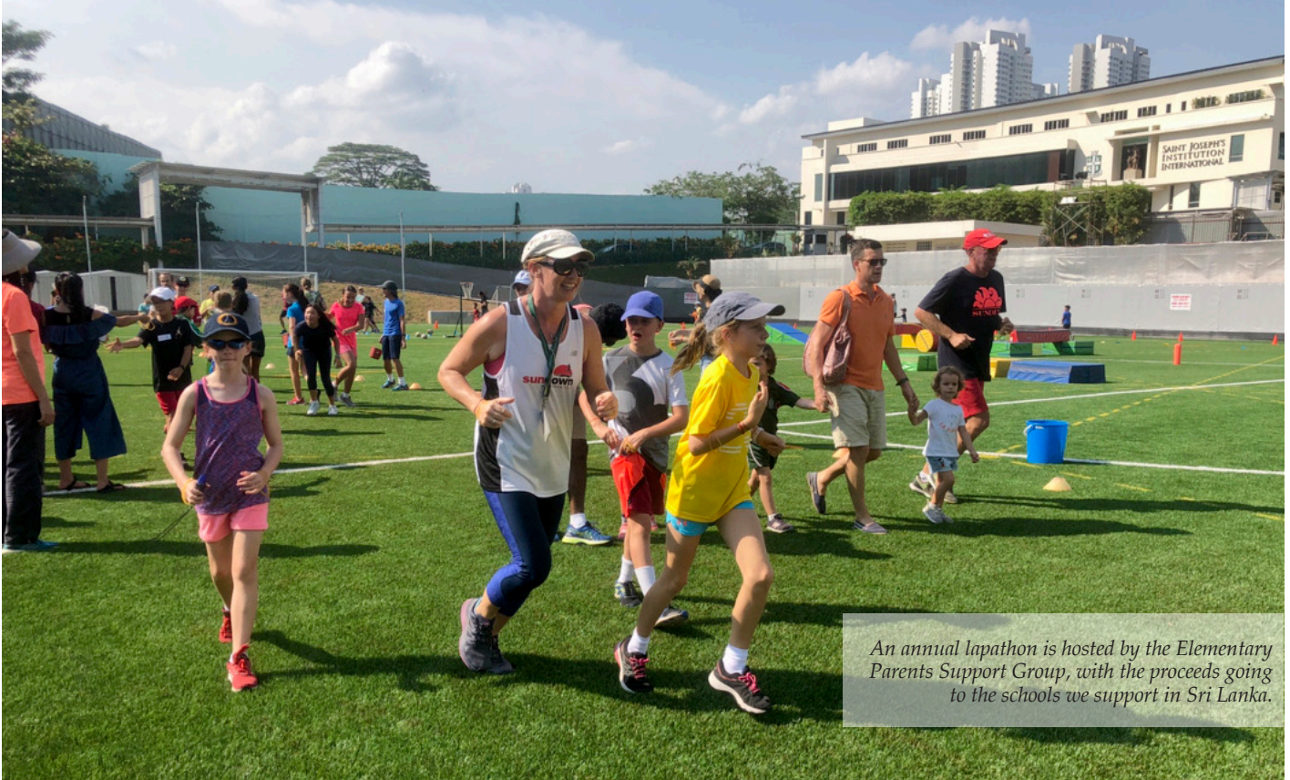
An annual lapathon is hosted by the Elementary Parents Support Group, with the proceeds going to the schools we support in Sri Lanka.