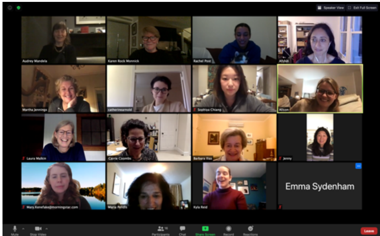
Photo from the October Drop-in Drinks

In September the Club had its first Drop-in Drinks event on Zoom, which served as an opportunity for alums to meet and catch up with one another from the comfort (and safety!) of home.