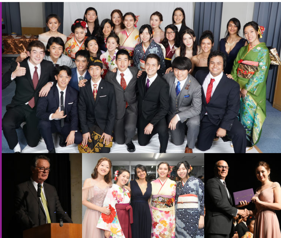
The 26 th graduating class of Osaka International School received diplomas Friday, June 7, in a standing room only theatre. Twenty-two OIS seniors received diplomas and three SIS students were also recognized for completing the IB Diploma Programme. OIS now has 423 graduates in its history.