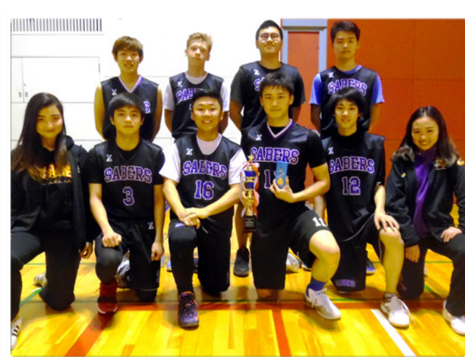
High School Junior Varsity basketball champions! Go Sabers!