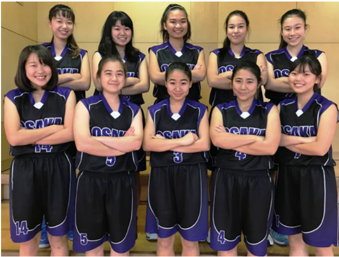
AISA girls basketball, champions