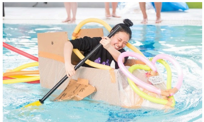
AISA math/leadership boat building fun