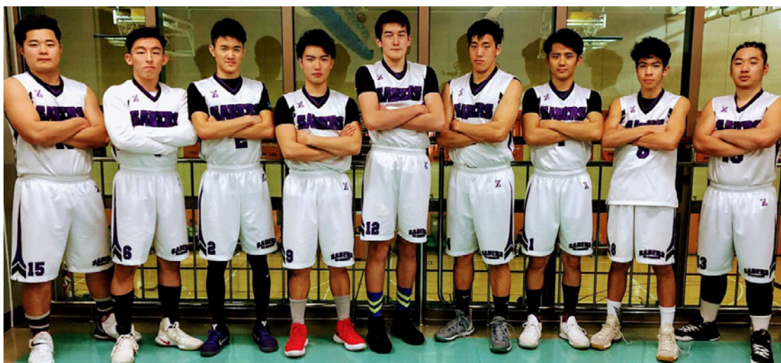
AISA boys basketball, 4th place

As always, thank you for your continued support of the Sabers activities program. Please contact the AD any time you need help. Please visit the AD office, room A-240, near the business office. Contact at pheimer@senri.ed.jp or at 072-727-2137.