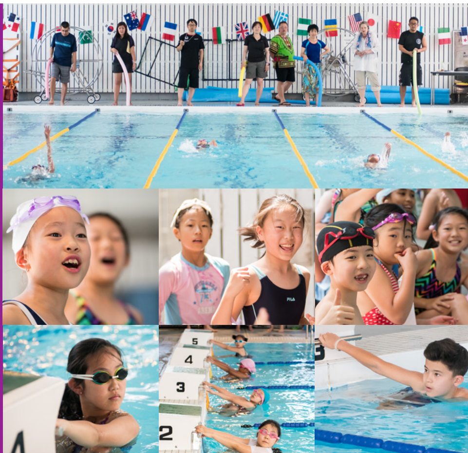
Elementary students had a great time in their swim carnival last week