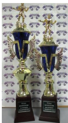
Sabers MS boys WJAA champions A and B divisions