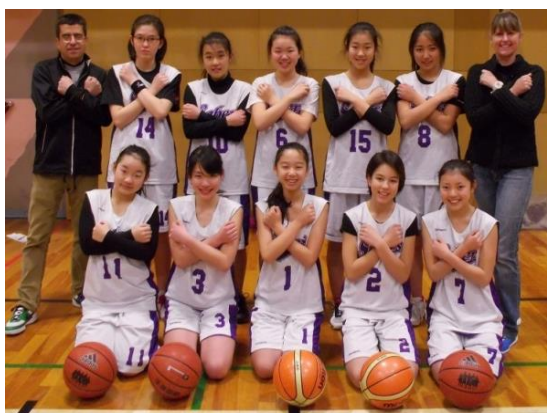
Sabers MS girls basketball A team