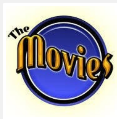
Movies at Meadville