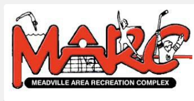
Meadville Area Recreation Complex