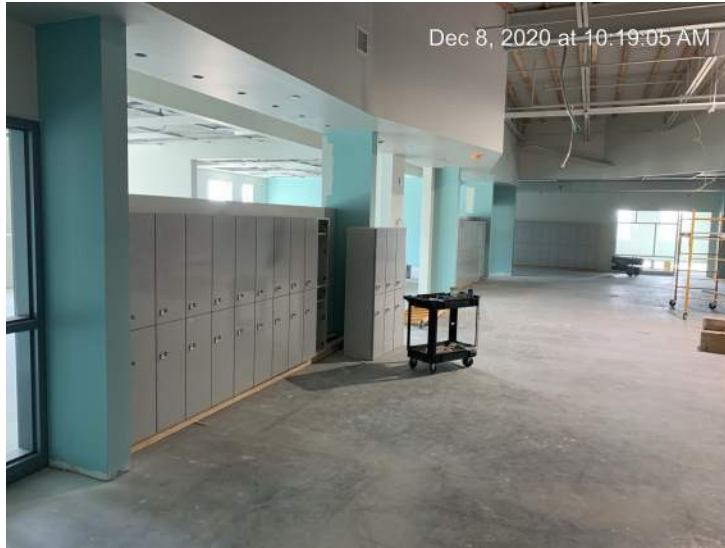
Area B LVL 2 - Paint and Cabinets