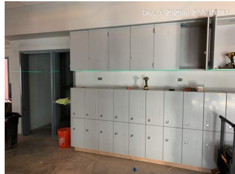
Area B LVL 1 - Paint and Cabinets