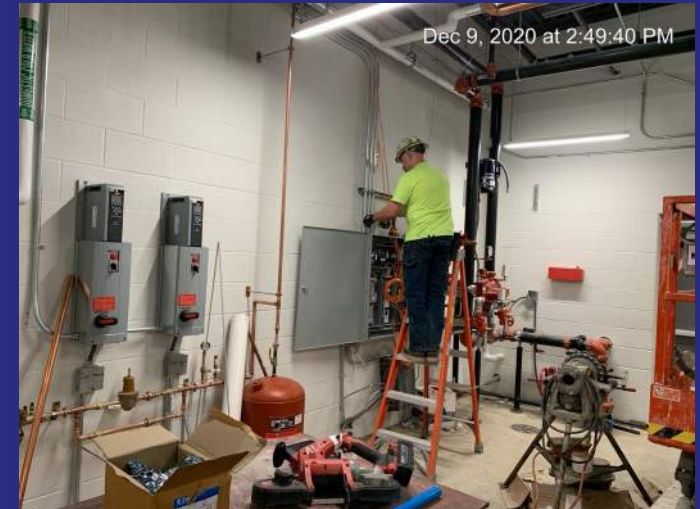
Systems being prepped for startup