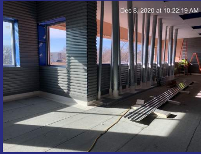
Outdoor Classroom - Siding