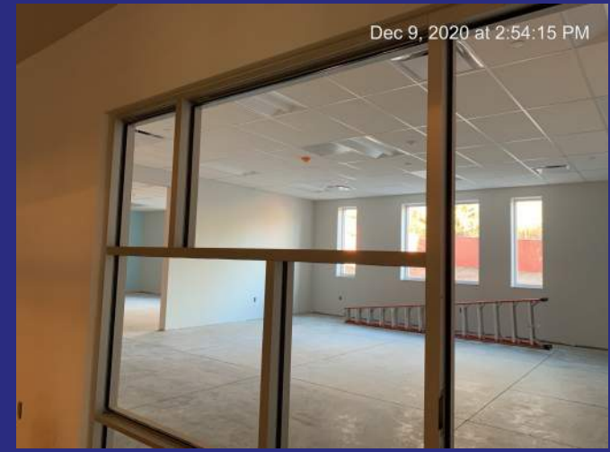
Area B LVL 1 - Ready for Flooring