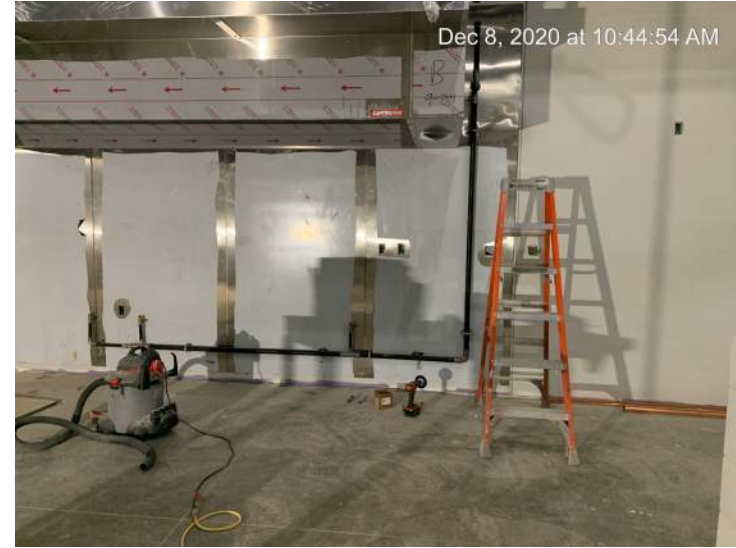
Kitchen Hood Set