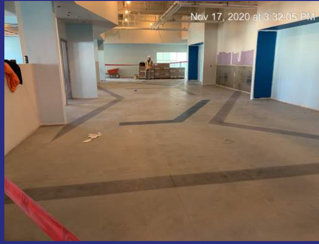
Floor Polish - Area B LVL 1