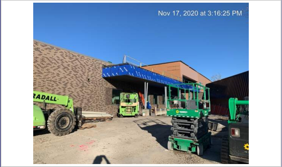
Exterior - Metal Soffit Install