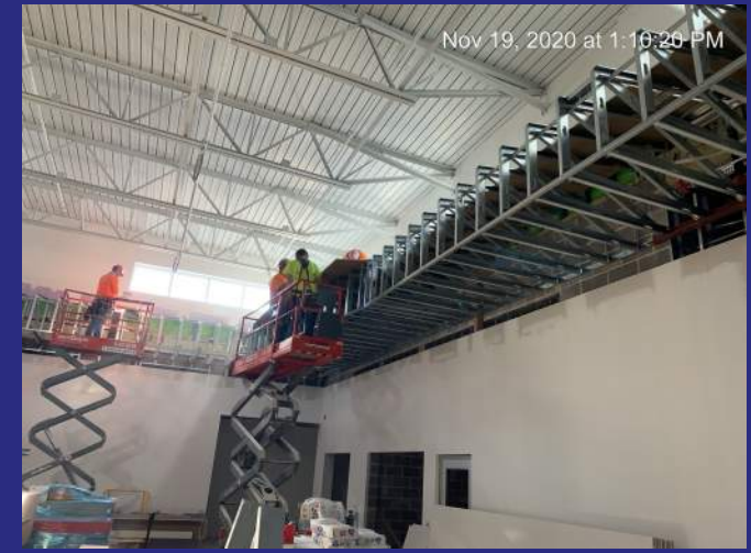
Soffit Drywall Hang - Area A LVL 1