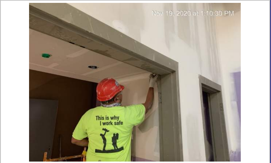
Area A - Painting