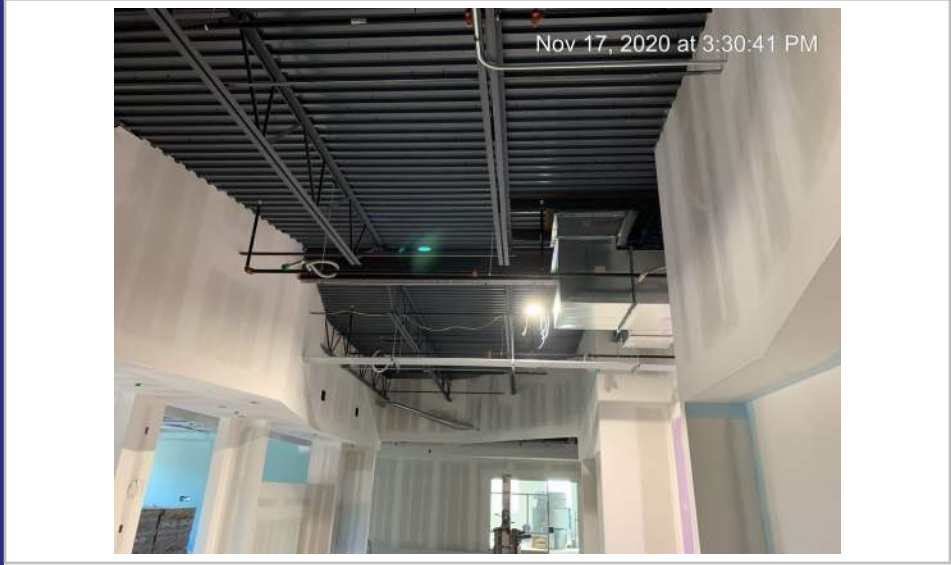
Ready for Paint - Area B LVL 2