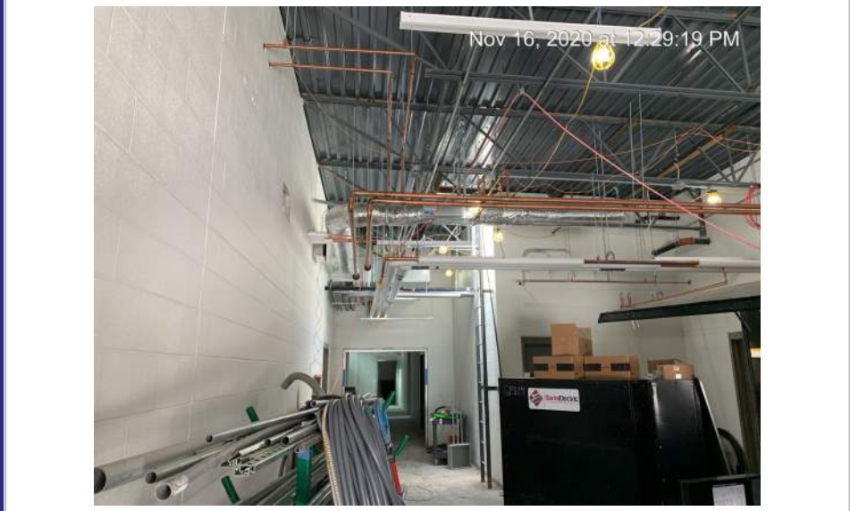
MEPs Back of House