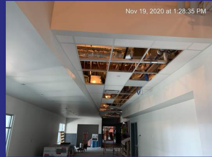
Finishes - Area B LVL 1