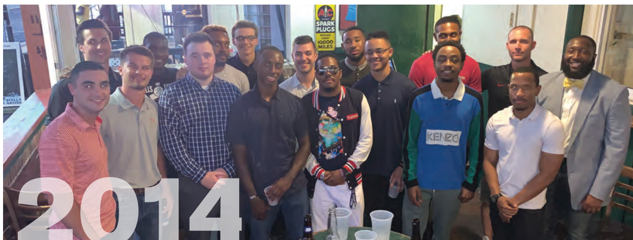
Some members of the Class of 2014 gathered for a 5 year reunion in August.